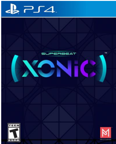
*Package Not Finalized